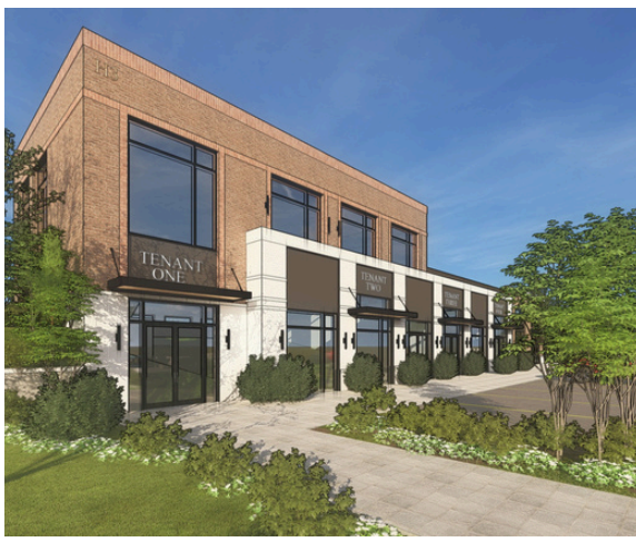
GREENVILLE COUNTY TAX MAP NO 0545020100501