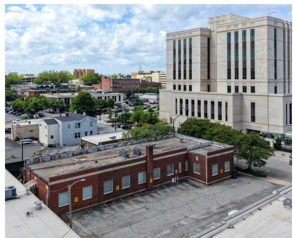
GREENVILLE COUNTY TAX MAP NO.0043000600400