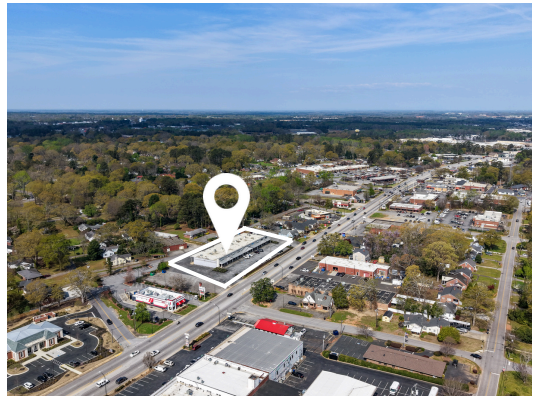
ANDERSON COUNTY TAX MAP #1221208005