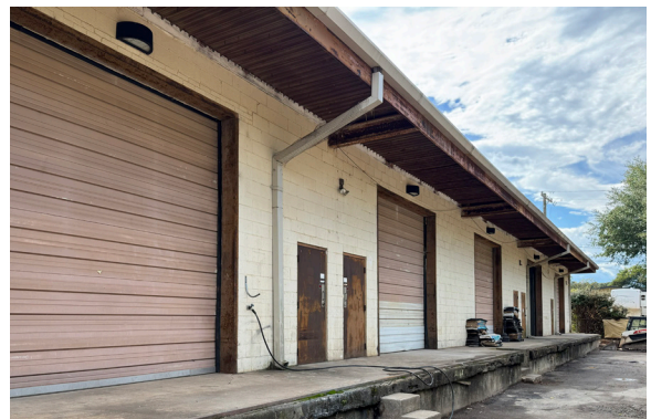
GREENVILLE COUNTY TAX MAP NO. 0151001301500