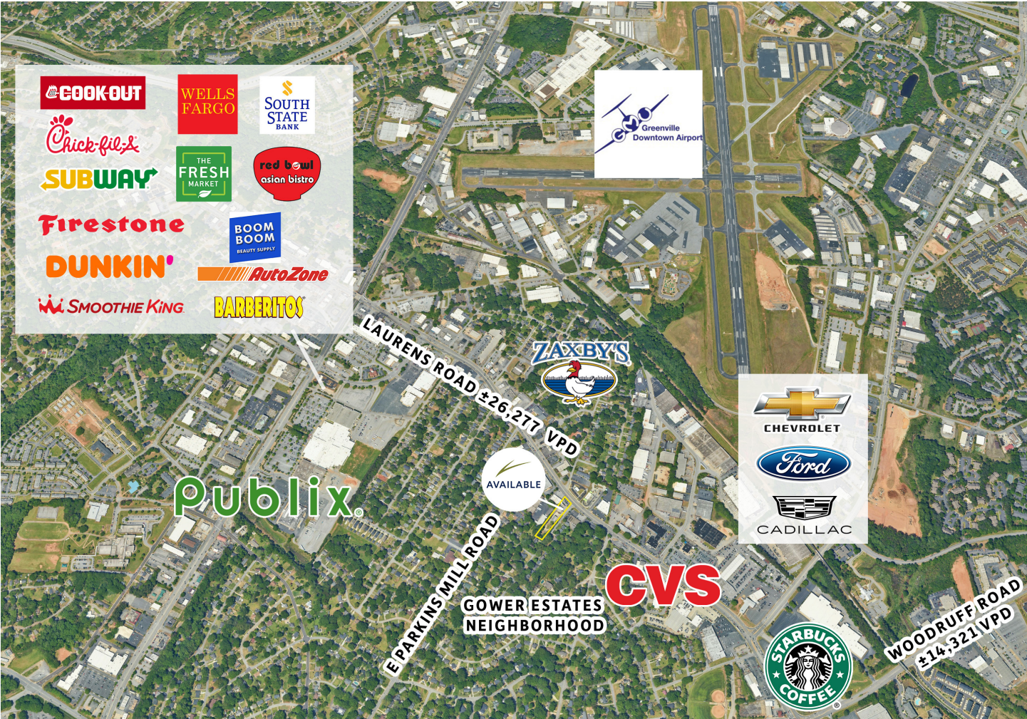
2046 Laurens Road Demographics