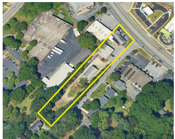
GREENVILLE COUNTY TAX MAP NO. 0265001300500