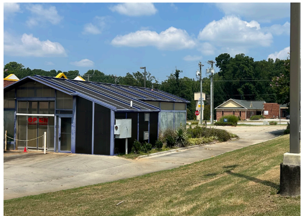
GREENWOOD COUNTY TAX MAP #6856-0808-840