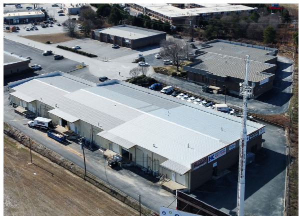
GREENVILLE COUNTY TAX MAP #0533020105100