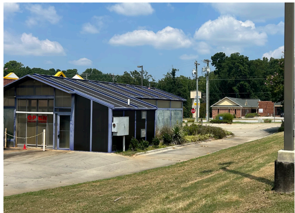
GREENWOOD COUNTY TAX MAP #6856-0808-840