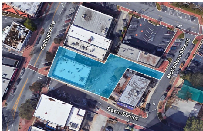
PICKENS COUNTY TAX MAP #4044-20-72-7091